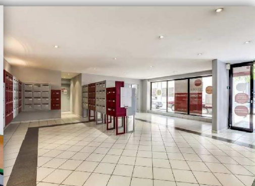
Entrance Résidence Nexity Riquier